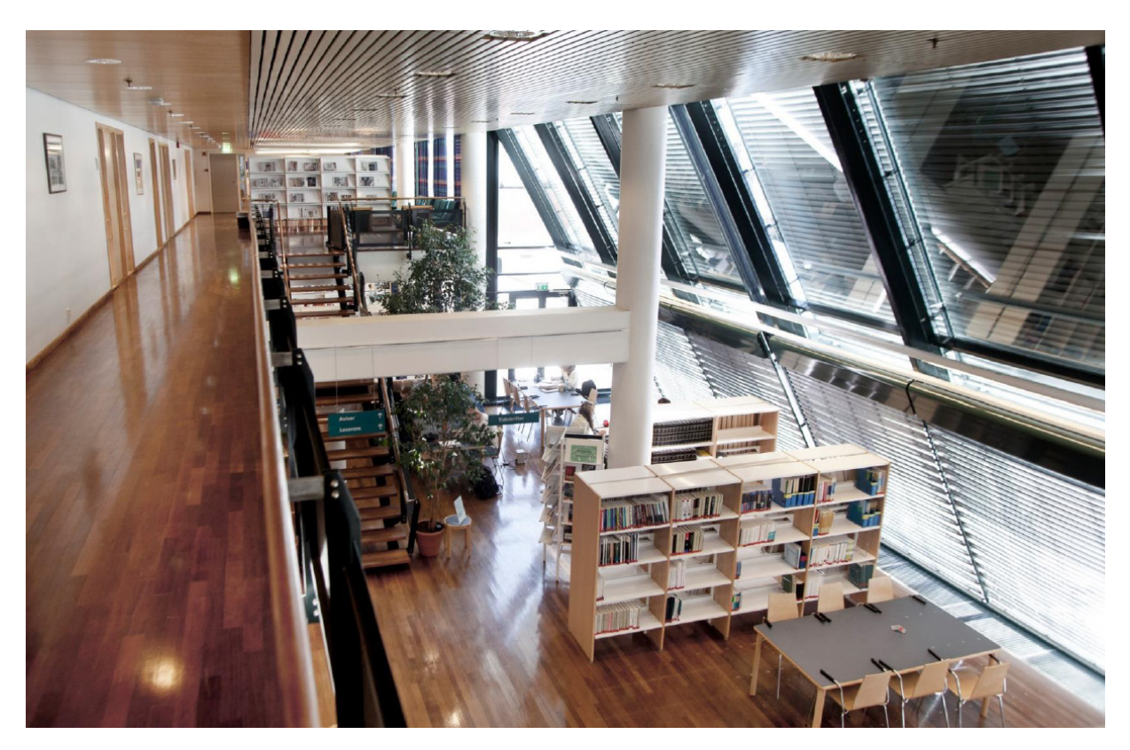
Library, NPUC Oslo