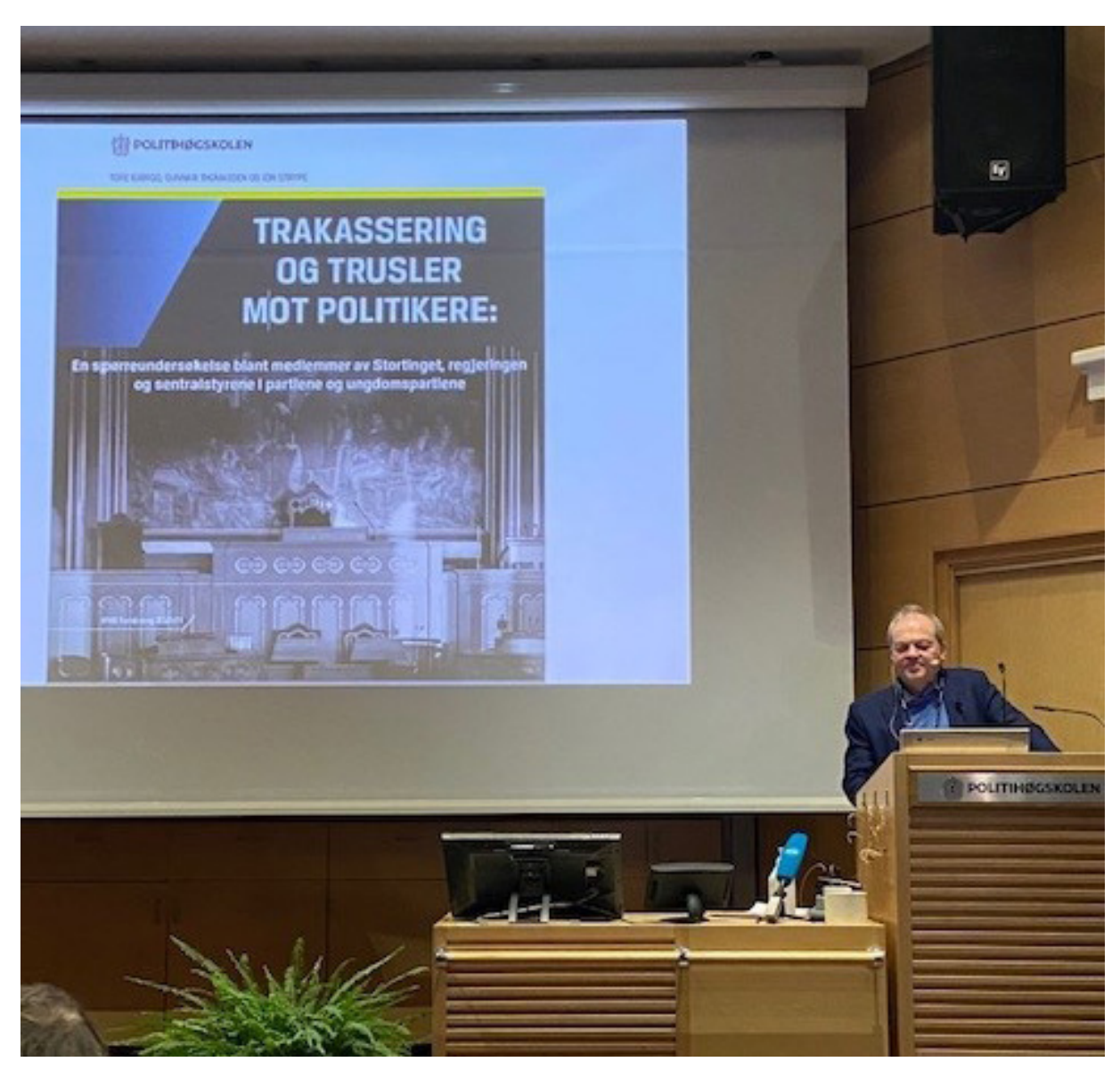
Press conference at NPUC, harrasment and threats towards politicians